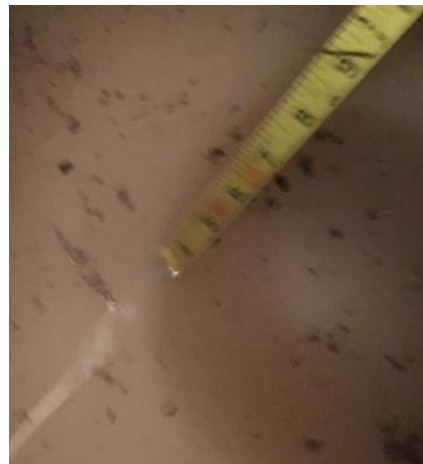
Infiltration Test 1 Measurements