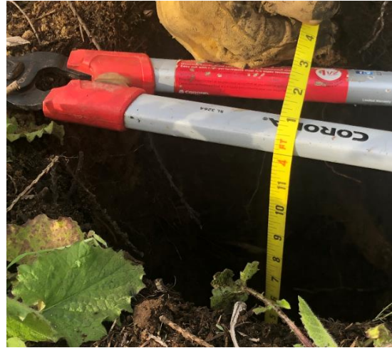
Subsurface Investigation Hole and Depth