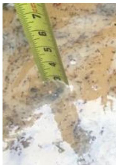
Infiltration Test 2 Measurements