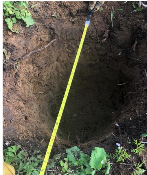
Infiltration Test Hole and Dimensions