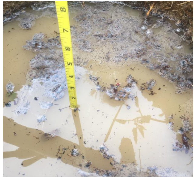
Pre-Soak Period Initial Fill