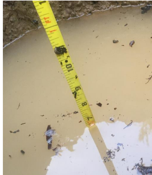
Pre-Soak Period Hour 1 and 2 Measurements